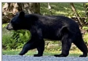
Cub Ridge Visitor, July 2022

Ursus americanus , the American Black Bear, has lived in Bears Crossing even longer than Joe Lodi! But, it turns out, most of us "barely" know our long-standing neighbor. According to the Vermont Fish and Wildlife Department's website , "Though bears are often thought to hibernate, they are not true hibernators. During true hibernation, body temperature, respiration, and metabolic rates are considerably decreased. A bear's respiration and metabolic rate do decrease during the winter sleep, but its temperature remains close to normal. Thus, a bear in a winter den can be easily aroused within moments, whereas in a true hibernator, it may take several hours." So, in any season, beware... If you disturb Yogi, he sure's to be... well, a bit of a bear.