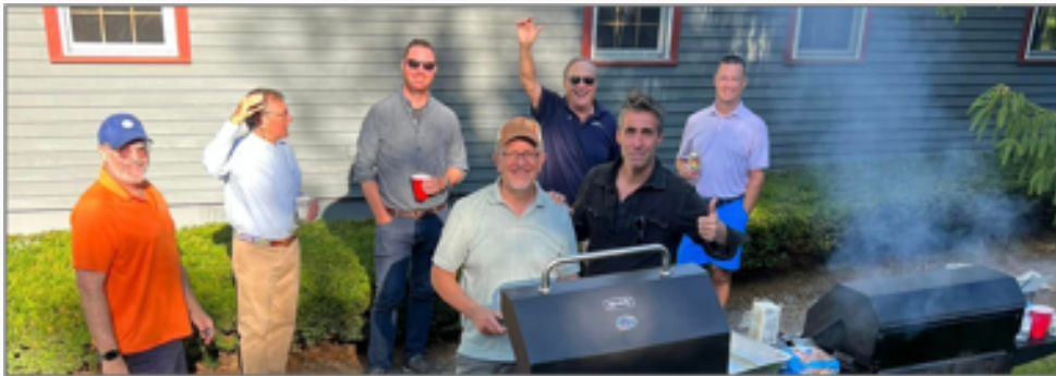
Owners' Meeting Potluck, Sept. 24, 2022

There are so many things on the burners this winter. We're happy to gather whenever we can and welcome new ideas for getting together. Please pitch ideas to us! Until we meet next, we wish you all the happiest of holidays.