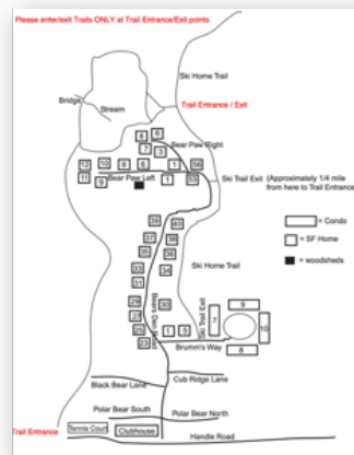
Bears X Snowshoeing Trail Map on W&B Owners' Website

Read a longer version of this article, including detailed trail descriptions, on www.bearscrossing.com/hiking .